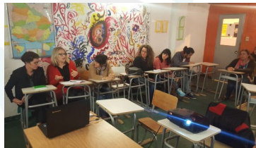
Learning Together at a prison in Montevideo, Uruguay, September 2017.