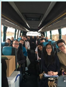
Driving to Grendon.

'Justice grows out of recognition of ourselves in each other; that my liberty depends on you being free too. The most powerful word in a democracy is 'we'. The word 'we' is owned by no-one and it belongs to everyone.' (Barack Obama)