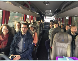
Driving to Whitemoor.