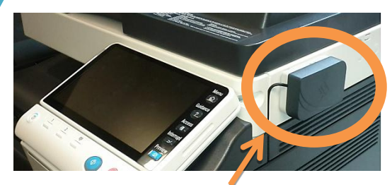
To begin, touch your card to the card reader located on the right hand side of the printer closest to you